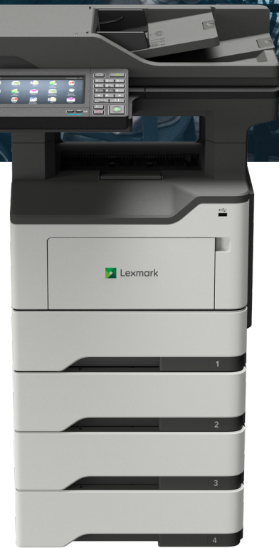
XM3250 with optional trays